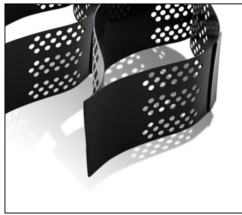
ABG Erosaweb (150mm depth shown)