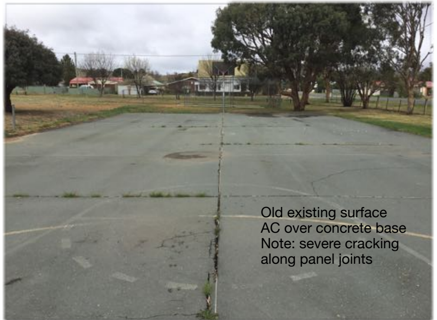
Old existing surface AC over concrete base Note: severe cracking along panel joints