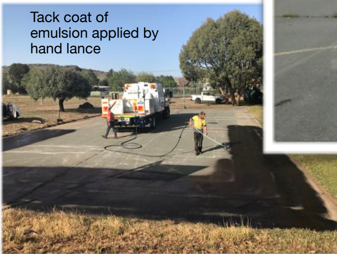
Tack coat of emulsion applied by hand lance