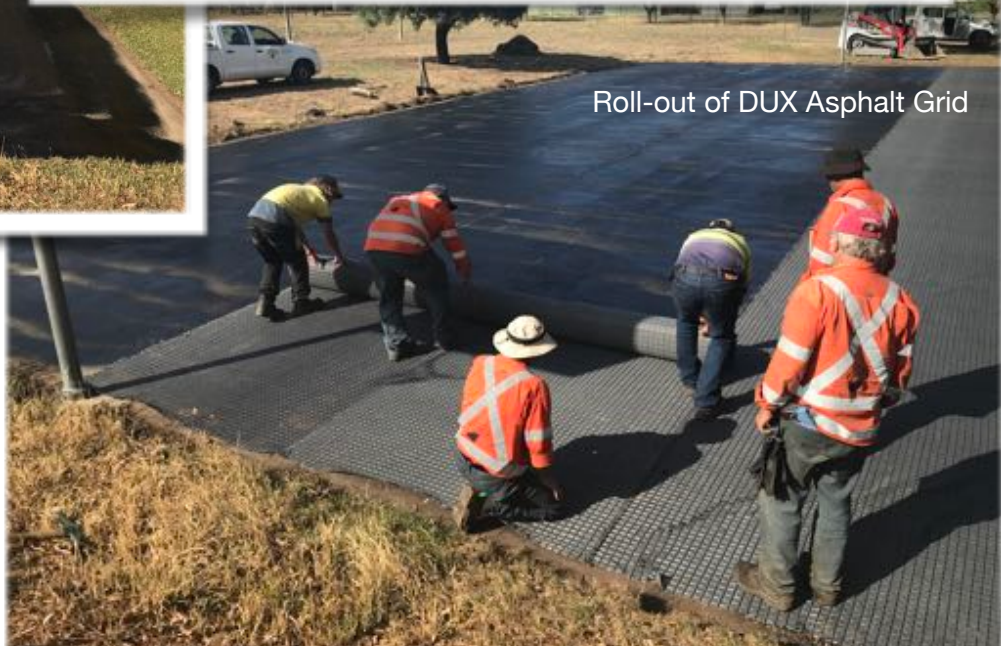
Roll-out of DUX Asphalt Grid