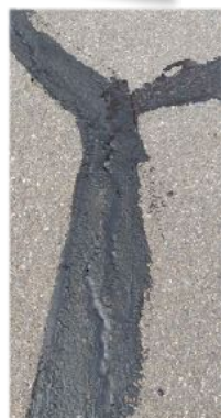
Severe Cracking prior to laying Roadgrid