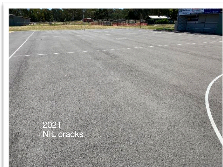
2021 NIL cracks