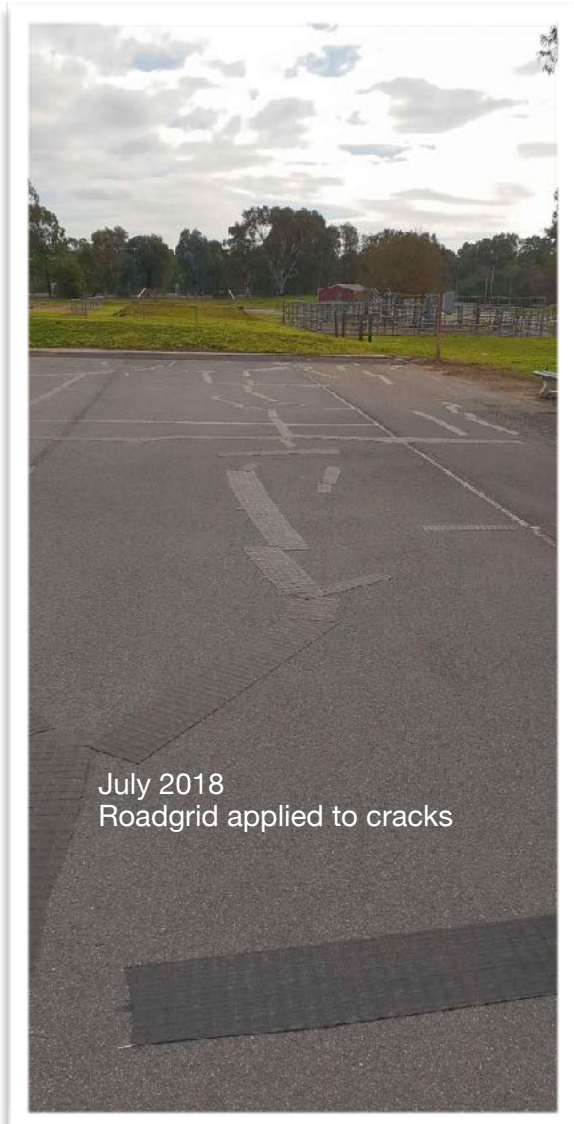
July 2018 Roadgrid applied to cracks