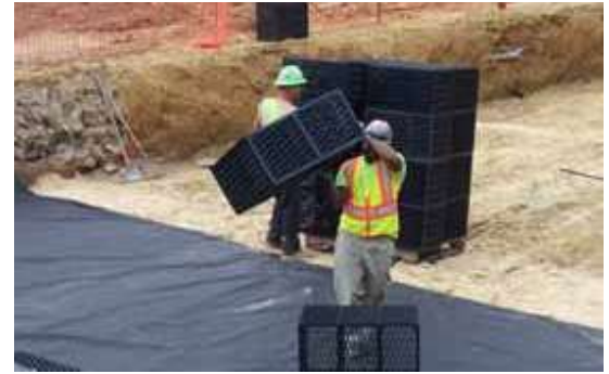
Most contractors find installing a Rainsmart Tank system surprisingly easy.