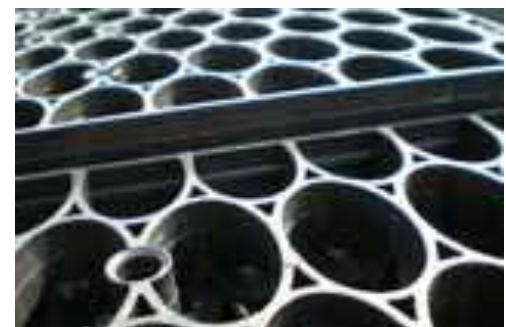
Fig 9A: Minor variations (less than width of the top plate) in height are acceptable.