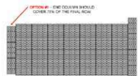
Fig 10: Plan view showing the end row turned perpendicular, corners may not matchup, so 2 options shown.