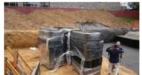
Fig. 3 Installation can be speeded up by either assembling the tanks in the excavation or placing the preassembled tanks in the excavation.

Assembly Instructions - following the drawings in Fig. 2: Connect four small panels (B) into one large panel (A) using the short pegs (not the long pegs). Attach small panels onto the large panel at the locations marked in white on Fig. 1. Do NOT use the row of pin-holes directly in the centre or the two middle rows nearest the edges, as marked in red on Fig. 1 unless you are building a 5-plate Ellipse Tank. Use 5-plate units for installation with more than 7' (2.1m) of cover, and for installations beneath traffic loads with less than 24" (600mm) of cover.