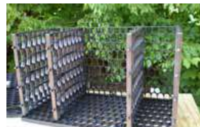
Fig 13: Additional Space for port can be created by moving the internal plates towards the ends

TIP: If using Prefabricated Pipe Boot Kits, install them onto the pipe now, leaving the band clamps loose so that final adjustments may be made in Step 7.