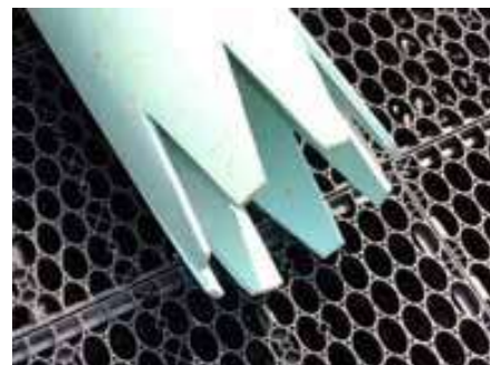
Fig. 14 Cut 8" (200mm) notches into the bottom of Maintenance Port.

TIP: If using Prefabricated Pipe Boot Kits, install them onto the pipe now, leaving the band clamps loose so that final adjustments may be made in Step 7.