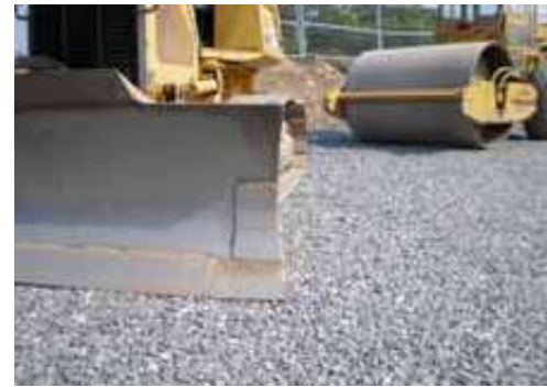
Fig. 5 Base must be smooth to ensure units fit together without gaps.

TIP: Creating a smooth, level platform will allow for faster installation of Ellipse Tanks, as they will fit together evenly, eliminating detail work that can delay your progress (Fig. 5).