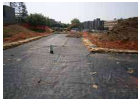
Fig. 25 Overlap Geogrid 18" (300mm) or as required by plans.

Geogrid must be placed 12" (300mm) above the Ellipse Tank. Overlap adjacent panels by 18"(450mm) minimum or as specified in plans. Roll out Geogrid over the top of the system, with the edges of the grid extending 5' from Ellipse Tank footprint or 3' from edge of excavation or more as show on plans (refer to CAD detail H20 loads).