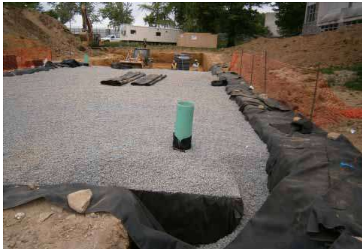
Fig. 24 Use an LGP dozer to push backfill over Ellipse Tank units.

TIP: When pushing backfill over Ellipse Tank units, work in the direction of the geotextile overlap to avoid shoving material between the fabric layers.