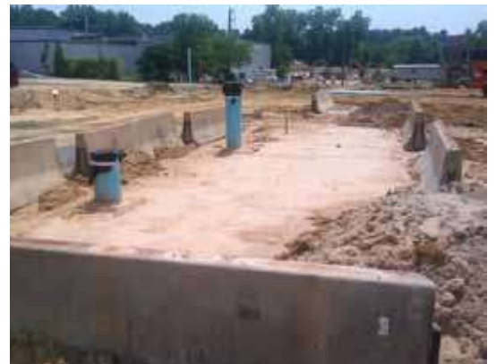
Fig. 27 Secured Ellipse Tank installation using Jersey Barriers.

IMPORTANT: Some projects require the use of cranes above the Ellipse Tank. While it is advisable to avoid this scenario, it may be feasible to utilize a crane over the Ellipse Tank based on the depth of the Ellipse Tank installation and the size and weight of the crane. Please consult the project engineer or Rainsmart for assistance prior to allowing a crane to drive over Ellipse Tank system.