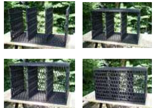
Fig. 2 Follow these steps to assemble a Std 4-Plate Ellipse Tanks

Assembly Instructions - following the drawings in Fig. 2: Connect four small panels (B) into one large panel (A) using the short pegs (not the long pegs). Attach small panels onto the large panel at the locations marked in white on Fig. 1. Do NOT use the row of pin-holes directly in the centre or the two middle rows nearest the edges, as marked in red on Fig. 1 unless you are building a 5-plate Ellipse Tank. Use 5-plate units for installation with more than 7' (2.1m) of cover, and for installations beneath traffic loads with less than 24" (600mm) of cover.