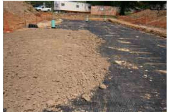
Fig. 25 Overlap Geogrid 18" or as required by plans.

Maximum cover for Ellipse Tank system is 7' (2.2m) with 4 internal plates or 10' (3m) with 5 internal plates. If your system exceeds these limits contact a Rainsmart Representative.