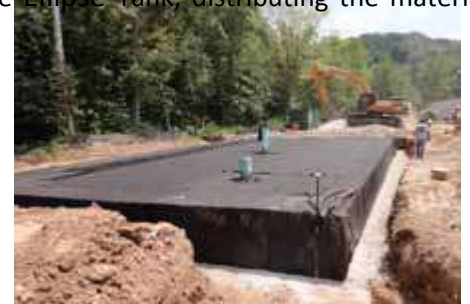
Fig. 22 “Walk” the geotextile into the corner to eliminate folds & air gaps. Use a trench roller or plate compactor to compact backfill in 12” (300mm) lifts.

IMPORTANT: Vibratory compaction of the side backfill (Fig. 23) is a critical step that both compacts the backfill and eliminates the minor gaps between individual Ellipse Tank units. While some backfill materials will yield a 95% proctor density without compaction, vibratory compaction of the material must be completed to ensure the stability of the system. Skipping this step will void the manufacturer’s warranty.