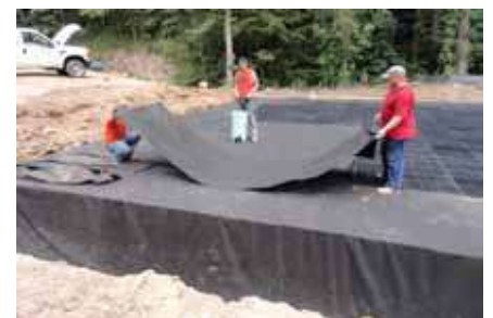
Fig. 20 Encapsulate R-Tanks with geotextile