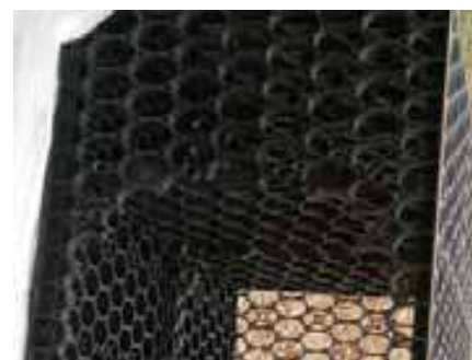
Fig. 15 if after adjusting the internal plates, the pipe will not fit, the top plate can be cut off-centre and one of the internal plates can be removed.