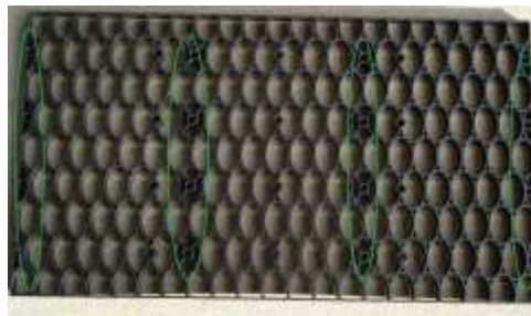
Fig. 1 Attach Small Plates at locations circled in Green such that all small and large Pegs on same side.