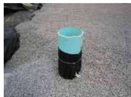
Fig. 17 Install port into R-Tank..