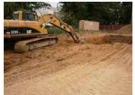
Fig. 4 Excavate according to plans, following all Government & OHS Regulations

Excavate the designated surveyed area according to plans following all relevant local, state and OHS guidelines. Typical excavations should include: