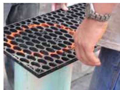
Fig 12: Cut the Horizontal Plates to accommodate all ports.

IMPORTANT: Do not over-cut the Ellipse Tanks Plates, Minimize the gaps between the pipe and the Ellipse tank plates. This is particularly important with the top plate.