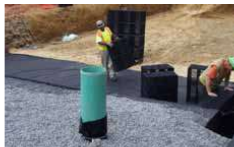
Fig 11: Installed inspection Port

TIP: If the location of Inspection Ports is not shown on your plans, use a single Inspection Port located in the middle of the field of Ellipse Tank units.