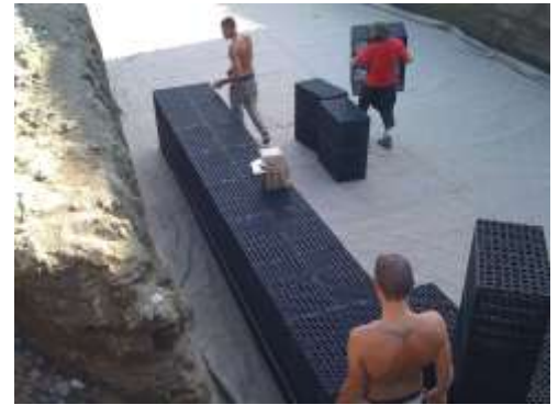
Fig 8A : Use a String line & marking paint to square the system footprint.

Tanks require ventilation for proper hydraulic performance, number of pipes and