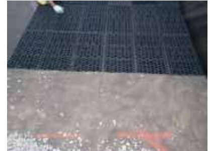
Fig. 18 Maintain 12" (300mm) overlap

Where the inlet and outlet pipes connect to the Ellipse Tank, cut an "X" into the geotextile so that the pipe makes DIRECT contact with the Ellipse Tank. Pull the flaps of the "X" over the pipe so that the flaps of the "X" point AWAY from the Ellipse Tank. Use a stainless steel band clamp to seal the flaps to the pipe.