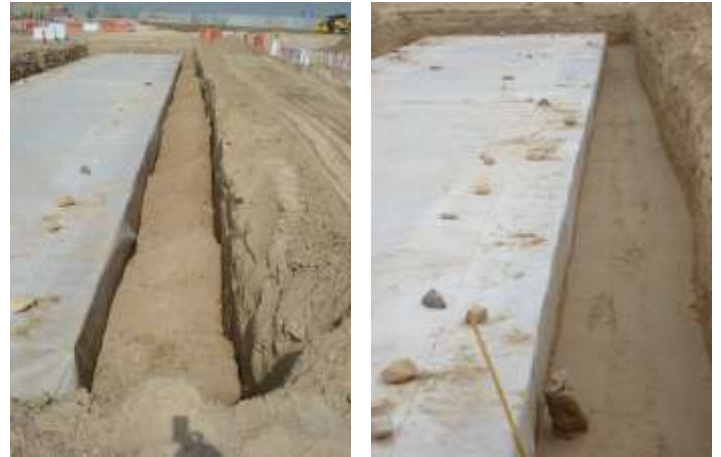
Fig. 23 Vibratory compaction of side backfill is always required, regardless of what backfill material is used.

Continue placing and compacting backfill in 12” (300mm) lifts until the material reaches the top of the Ellipse Tank units.