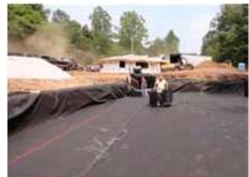
Fig 8: Use a String line & marking paint to square the system footprint.