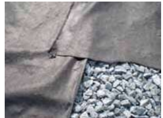
Fig 7: Overlap Geotextile by minimal 12" (300mm) or more.