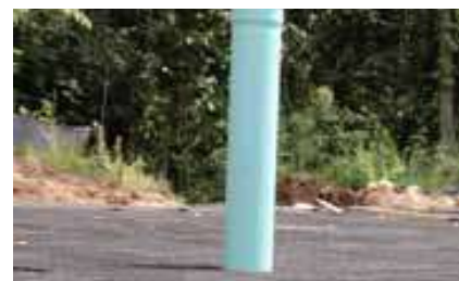
Fig. 16 Installed maintenance port