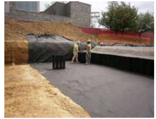
Fig 6: Pull Wrinkles out of Geotextile so Material lays flat.

IMPORTANT: If using a liner, be careful not to puncture it with stakes or pins while placing your string line.