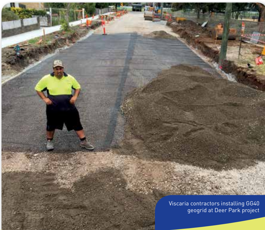
Viscaria contractors installing G640 geogrid at Deer Park project