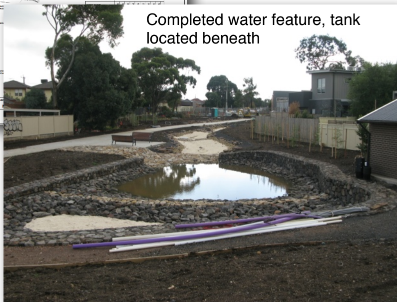
Completed water feature, tank located beneath