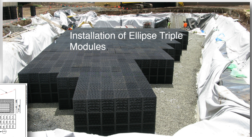
Installation of Ellipse Triple Modules